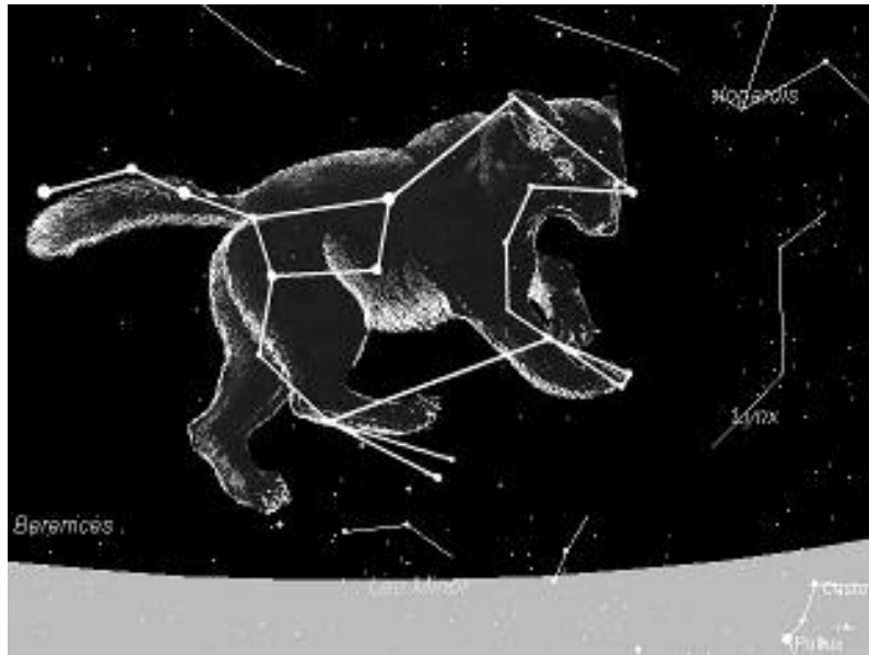
Figure 1. Usra Major is seen to walk along the horizon (set for the evening at 45 North in current times) in the greening-time of the biosphere. The horizon is the light grey area and the diurnal movement of the earth causes the bear to move from left to right over the course of the night.

What does it mean? I truly have no idea except to think that there are star voices out there that we can no longer hear. Yet we would all agree that at its heart astrology is about the relationship we have with the sky. The horoscope is our attempt to map this symbolic but also practical relationship that exists in the space between earth and the firmament. In fact the horoscope is a map of the sacred place that exists between two worlds; the place where life exists in the thin membrane maybe only a few miles wide between the planet and the universe. Your chart is your personal map of the edge of these two worlds, the sacred place of meeting where life hovers between the rock of the earth and the boundless universe of space 4 .